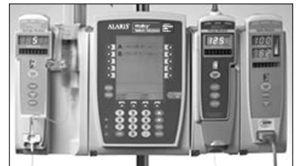
Alaris Guardrails Software

The Alaris Guardrails Safety Software Suite for the Medley Medication Safety System is designed to help hospitals improve intravenous medication safety. The software manages how medications are programmed on an electronic infusion system by setting limits of infusion rates, doses, and volumes. The Guardrails Safety Software is the software application that resides in Alaris' Medley Point-of-Care Unit, a point-of-care management system that incorporates infusion, patient monitoring, and clinical best practice guidelines. For more information, visit www.alarisimed.com .