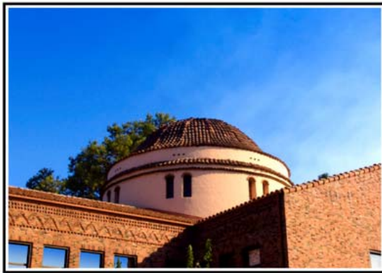
KENDALL HALL c.s.u., chico

Email phil@phildynan for larger images – state your required specifications