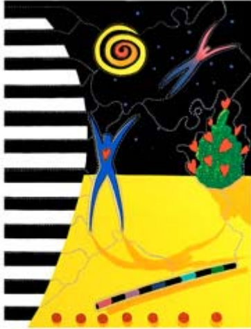
ALL THINGS ARE CONNECTED PHIL DYNAN